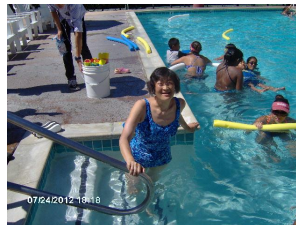
Summer Swim Camp